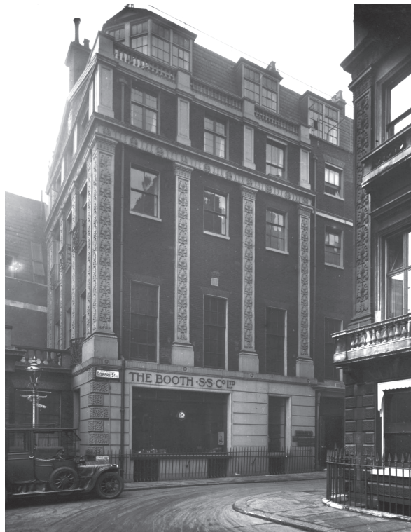
A 1933 Photograph of the Former Caledonian Hotel at the Corner of Robert Street and Adelphi Terrace, Adelphi, London. Kamehameha II was taken to the Caledonian Hotel after becoming ill and passed away here in 1824. He lay in state in the room occupied by Booth SS Co Ltd in 1933.

Three more articles, all entitled "Death of the King of the Sandwich Islands," appeared July 15. The articles mirror each other and contain only slight differences. All three relate the bare details of the