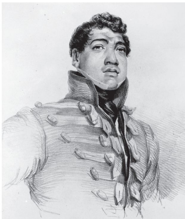
As Kamehameha II Appeared to Londoners during His 1824 Visit. From John Hayter's lithographic print first published in London in June, 1824, shortly before the king died.