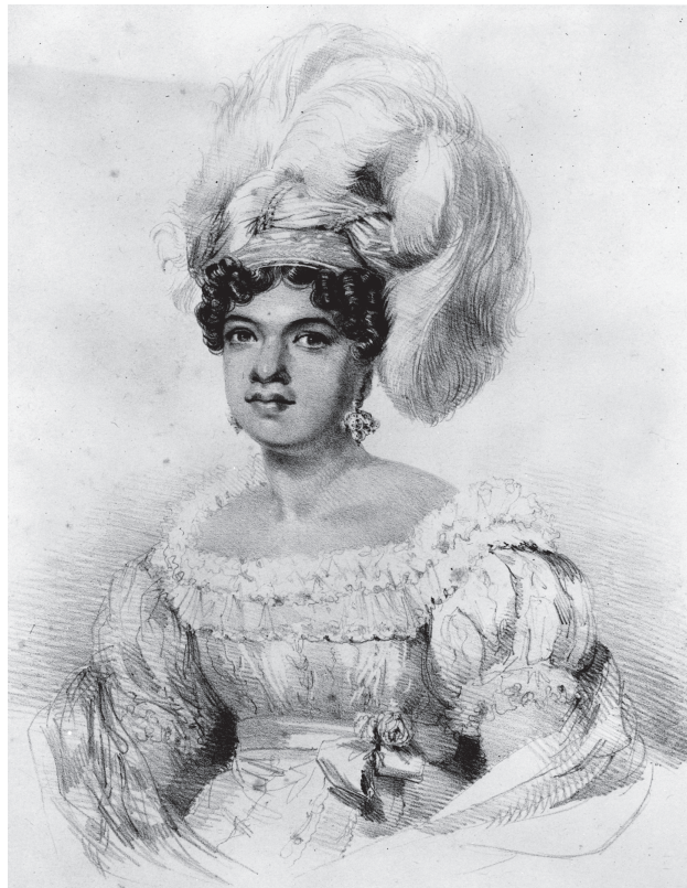
As Kamamalu May Have Dressed for a London Outing. From John Hayter's lithographic print first published in London in June, 1824, shortly before the queen died.